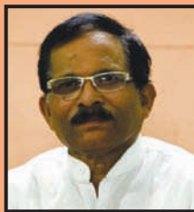
Hon'ble Shri. Shripad Yesso Naik Minister of AYUSH, Govt. of India