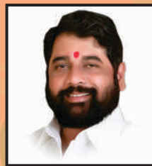
Hon'ble Shri. Eknath Shinde Health & PWD Minister, Maharashtra State