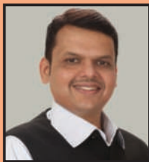
Hon'ble Shri. Devendra Fadnavis Chief Minister, Maharashtra State