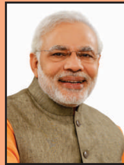
Hon'ble Shri. Narendra Modi Prime Minister of India