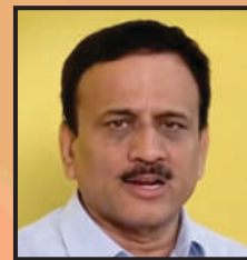
Hon'ble Shri. Girish Mahajan Water Resources & Medical education Minister, Maharashtra State

“AYUSH World Expo 2019 & Arogya” with the support of “AYUSH Ministry, Govt. of India” has been organised at CIDCO Exhibition Centre, Vashi, Navi Mumbai, Maharashtra from 22 nd to 25 th August 2019.